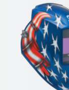
Stars and Stripes II™ #257 216