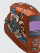
Vintage USA™ #257 215