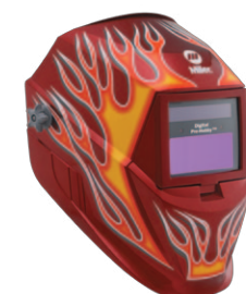
Red Flame #256 168