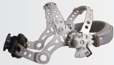
NEW HEADGEAR #256174