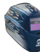
Blue Heat™ #256 170