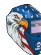
American Eagle™ II #256 167