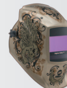
Sinister™ #256 157