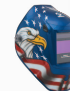
America's Eagle™ #256 161