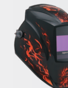
Inferno™ #257 217