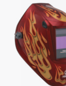
Fireball™ #256 162