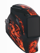
Inferno™ #235 627 (6 pack) #238 496 (each)