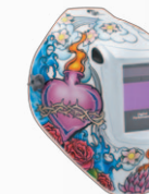
Illusion™ #256 165