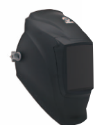
Black #235 626 (6 pack) #238 497 (each)