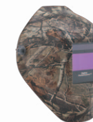
Camouflage #256 163