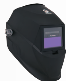
Black FS#10 #231 703 (only sold in quantities of 4) Black Variable Shade #251 292