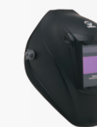
Black #256 159