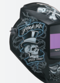
Lucky's Speed Shop™ #257 214