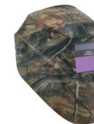
Camouflage #256 169