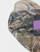
Camouflage #256 173