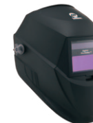
Black #256 166