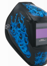
Blue Rage™ #256 164