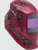
Fury™ #256 158