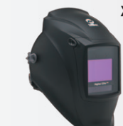
Black #257 213